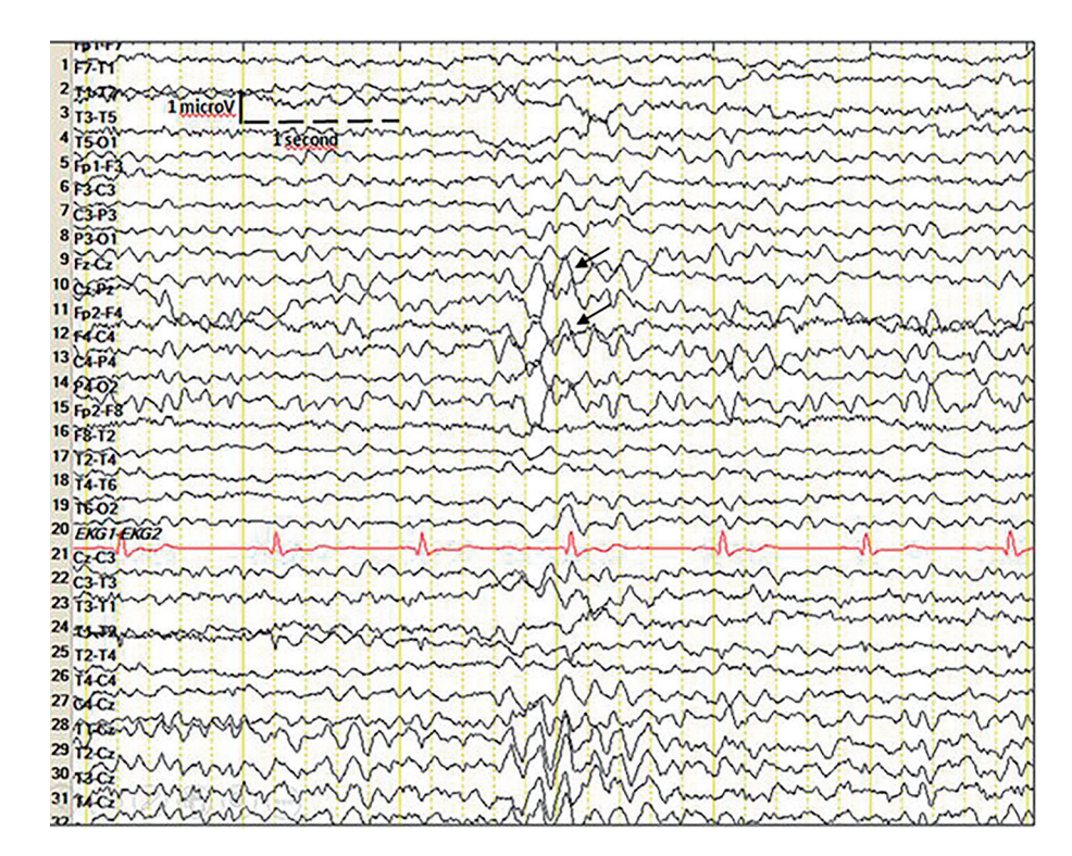
Figure 1. Routine EEG shows right centro-parietal paroxysmal disturbances characterized by sharp and slow waves. EEG: electroencephalogram.

contributions to our understanding of the physiology of corticospinal pathways in normal and pathological backgrounds.