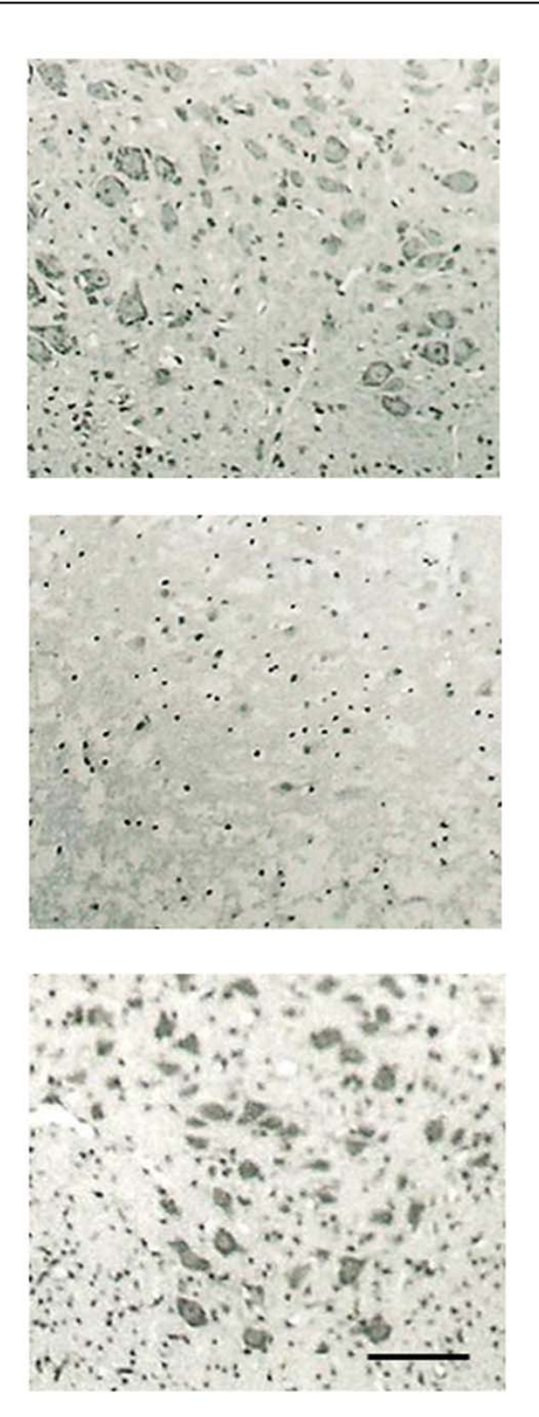
Figure 1. Morphology of spinal motor neurons. Effect of PPX on organotypic cultures of rat spinal cord. Upper: control cultures; Middle: glutamate-treated culture; Lower: co-treatment with glutamate and PPX-treated cultures. (The bar represents 50 \mu m); Treatment with glutamate produced a marked loss of spinal motor neurons compare to control culture; Treatment with PPX protected spinal motor neuron loss against glutamate-induced neurotoxicity.

mm in diameter. Culture medium consisted of Delbecco's modified Eagle's medium only. Antibiotics and antifungal agents were not used. Cultures were incubated at 37°C and maintained in a humidified atmosphere of 5% CO2 and 95% air at 37°C. The experimental procedure was performed according to the Guidelines of the Animal Committee, Toho University Ohashi Hospital.